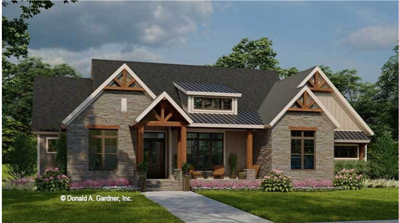
JOB PLAN N NO. 1652